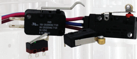
Snap Action Switches

The J115F1 Series relay offers heavy contact load with 30 to 50 amp versions. Also available in panel mount this PC pin mounted UL relay offers 1A, 1B or 1C contact arrangement with coil voltage ranging from 5VDC up to 277VAC with DC coil power of .60W or .90W and AC coil power of .2VA. Dimensions are 31.7 x 26.9 x 20.3mm. This UL-approved relay is available with or without a dust cover. Agency approval is UL E197852 and TUV-certified.